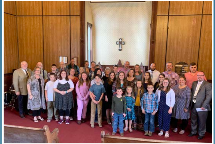
OPEN ARMS FELLOWSHIP CHURCH OF GOD