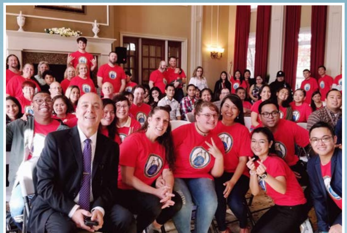
FAITH FOR LIVING FAMILY WORSHIP CENTER