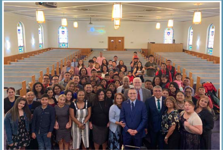
IMPACTO CELESTIAL CHURCH OF GOD